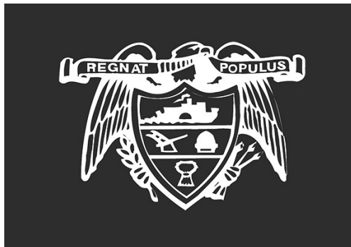
Family of 7 alive, saved by toddler