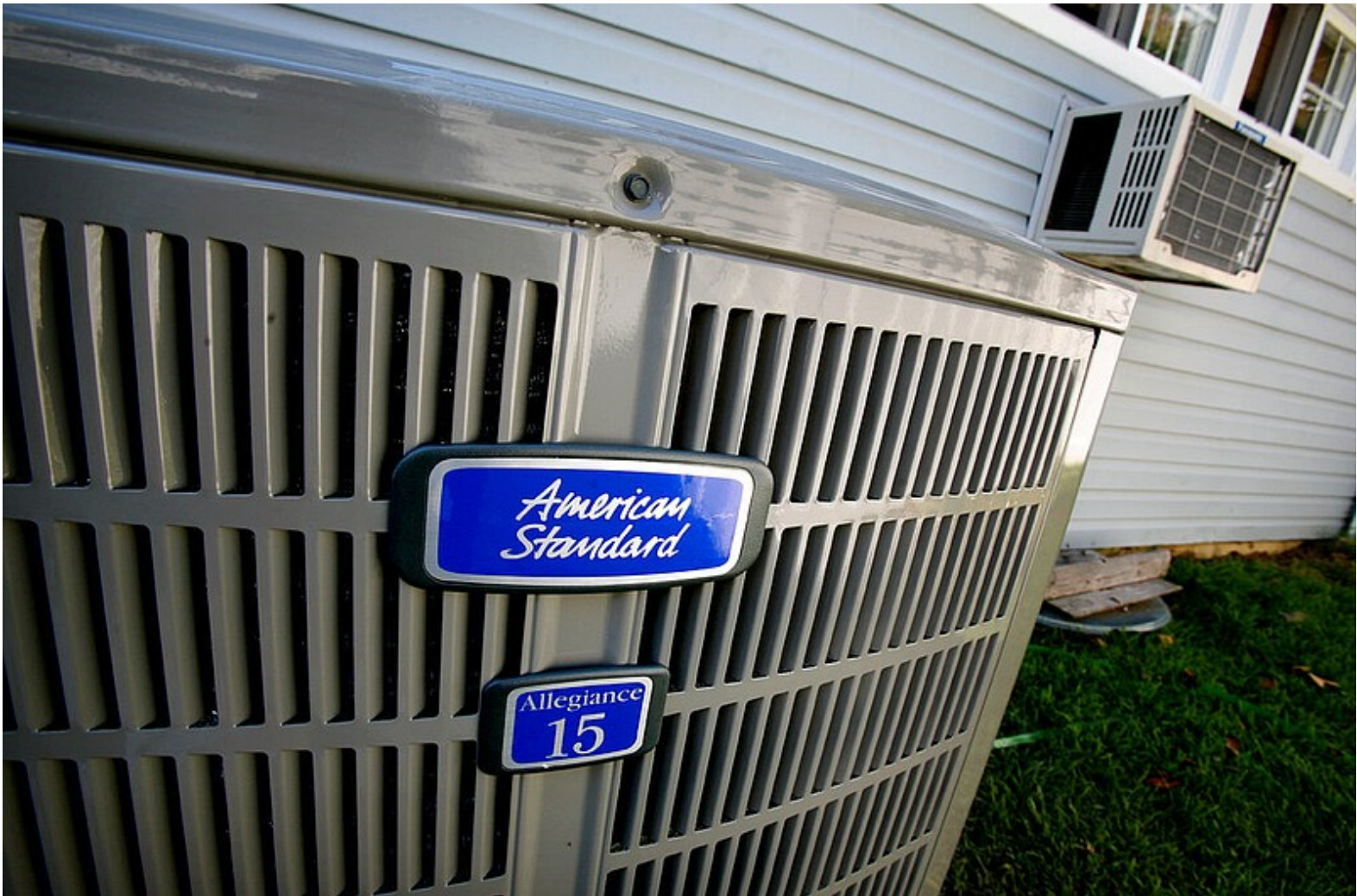
An American Standard Allegiance 15 air conditioning unit is hooked up and ready to replace the window air conditioning unit in this Aug. 8, 2008, file photo.

WASHINGTON -- A federal infrastructure law is giving more than $800,000 to Arkansas through a federal assistance program that helps low-income families with home energy costs, according to the U.S. Department of