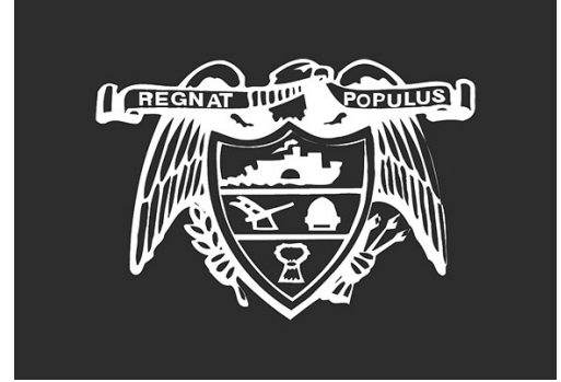
Hope for students