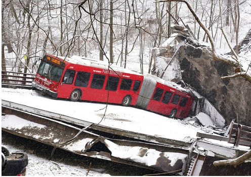
Congress impasse holding up infrastructure money