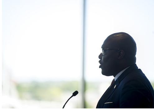
Little Rock mayor discusses infrastructure funding with Washington officials