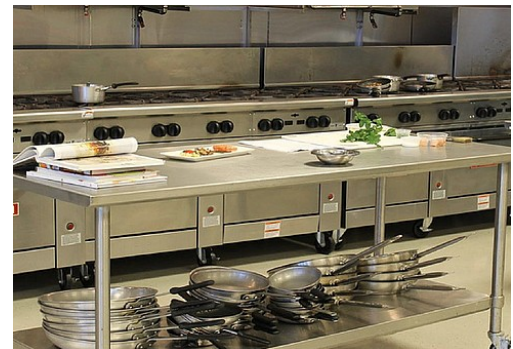
Benton County restaurant