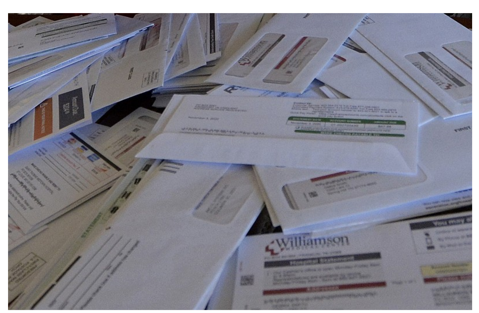
A pile of medical bills is shown in this Oct. 7, 2021, file photo.

Nearly 24,000 Arkansans had their medical debts paid off by philanthropic organizations, the groups announced Thursday morning.