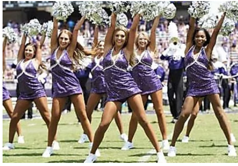
Worst Colleges: Make Sure You Don't Go Here.. "Arkansas Takes The Cake" Bon Voyaged