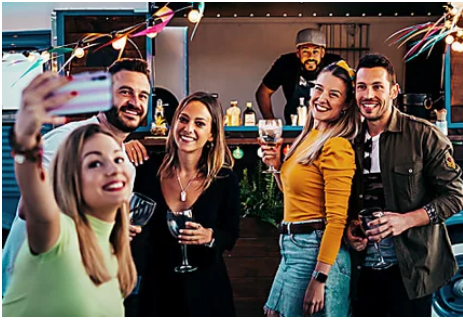
Top 6 Cards If You Have Excellent Credit NerdWallet