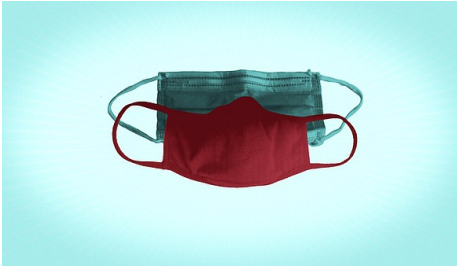
LIST: These Arkansas cities and schools are keeping mask rules in place