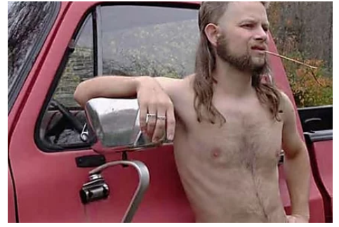
[Pics] Each state hilariously depicted by one photo TooCool2BeTrue